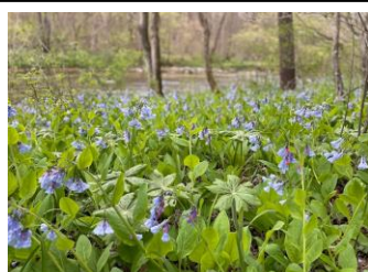
Hiking Gunpowder among Bluebells; many trails to choose from!