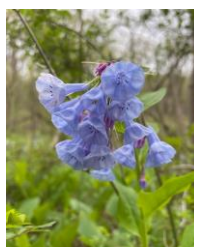
Gunpowder State Park Bluebells